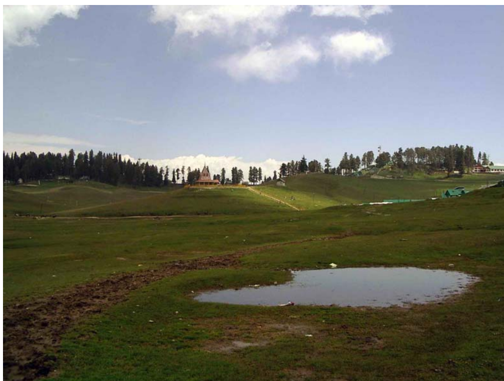
Figure 2. The breeding habitat of Bufo latastii in Gulmarg, 2620 m a.s.l., 30.04.2013 (Kashmir Valley, India).

The MaxEnt model for B. latastii had robust evaluation metrics ( AUC_{test} = 0.972 \pm 0.008 ) and showed significance for the binomial omission test, indicating good performance of the model. The predicted potential niche model under the current climate conditions is shown in figure 4. Of the parameters included in the model, altitude was the variable with the highest percent contribution for the species (36 %). Additionally, EVI's contrast (reflected heterogeneity of habitat), temperature seasonality and precipitation of coldest quarter had notable contributions (16, 11 and 11 % respectively). According to the model, the most suitable habitats for the species were located in Kashmir Valley, as well as in Dras and Suru valleys in western Ladakh (India) and Kunhar, Shountar, Skardu, and Shigar valleys in Pakistan.