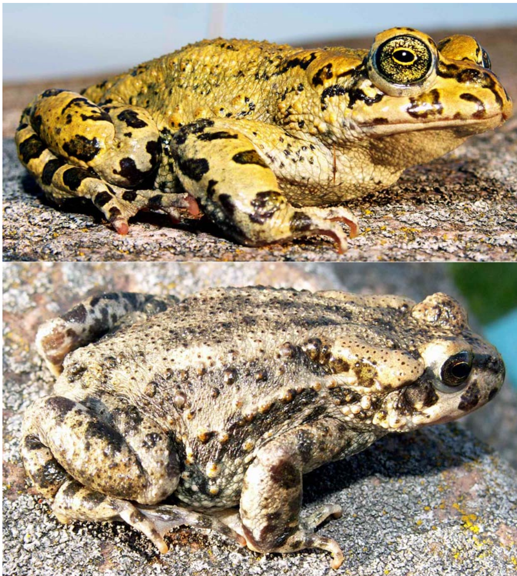
Figure 1. Male (above) and female (below) of Bufo latastii from Kuns, 1506 m a.s.l. and Pahalgam, 2031 m a.s.l. respectively (Kashmir Valley, India).

Later, Dubois & Martens (1977) examined external morphology and breeding calls of green toads from the Kashmir Valley and western Ladakh and suggested that only Bufo latastii is distributed in these regions of India. Moreover, the authors provided many records with map of B. latastii and other toads in the Western Himalaya and reported that the species was quite abundant in the Kashmir Valley and western Ladakh.